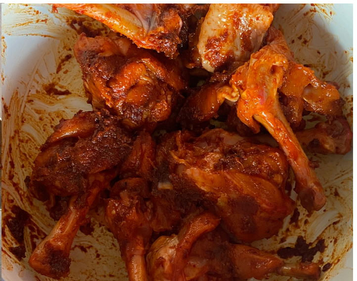
4. Keep them for at least half hour.