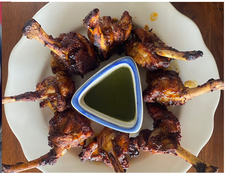
10. Serve with a dip of your choice.