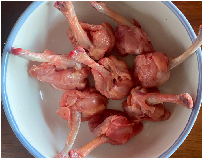
1. Apply salt and lime juice, keep for 10 minutes.