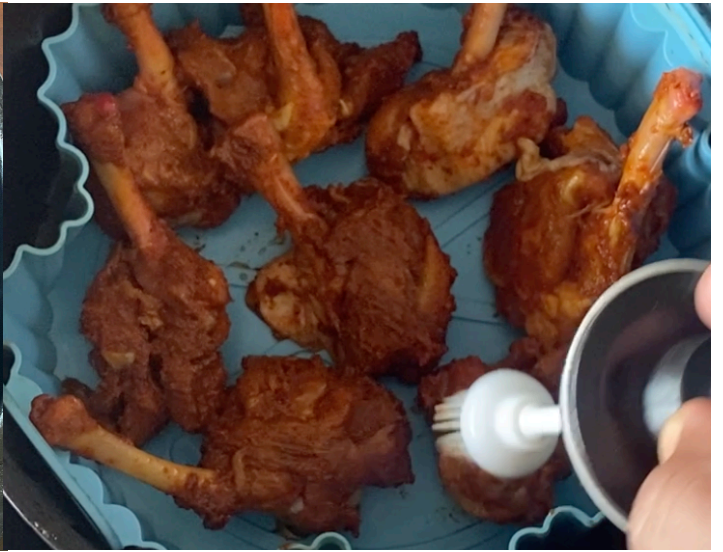
6. Brush them with some oil or unsalted butter.