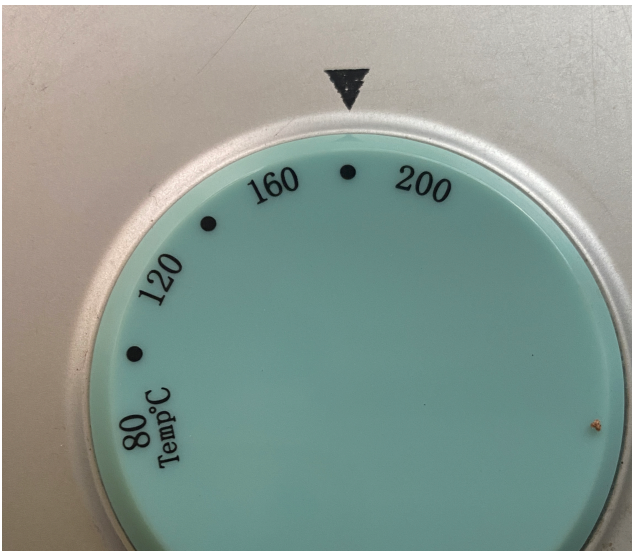
7. Set at 180 degrees Celsius and fry for 20 minutes.