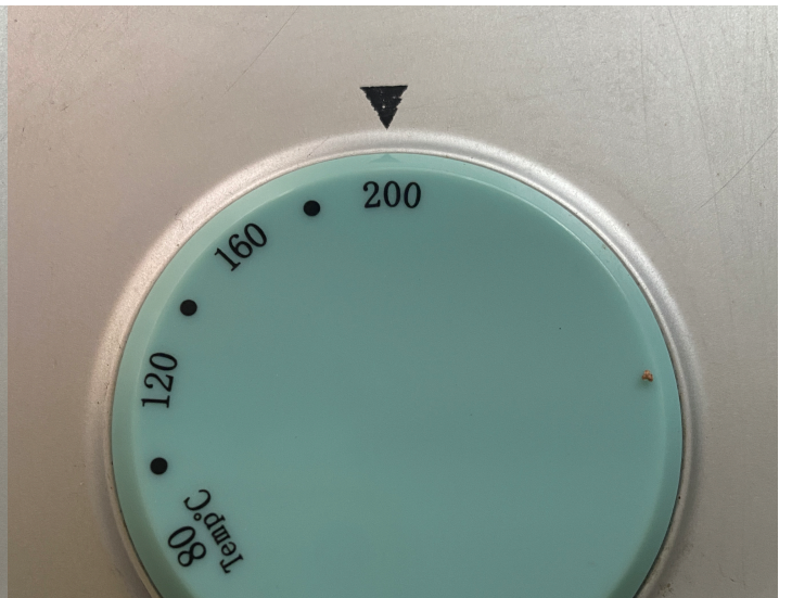
8. And then at 200 degrees for 5 minutes