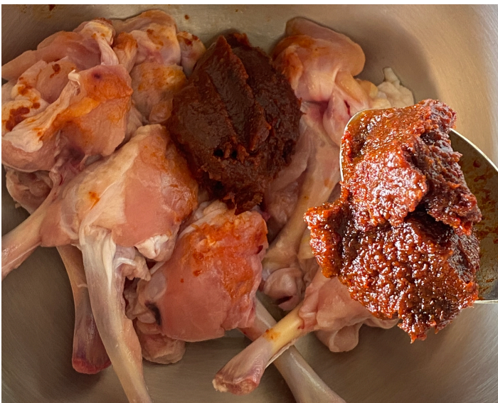
3. Marinate with the Red Recheado masala.