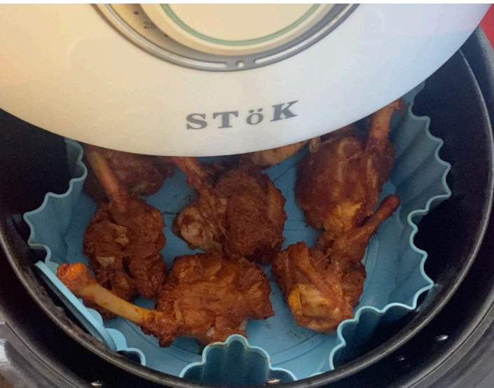
9. Take it out of the fryer, Adjust salt.