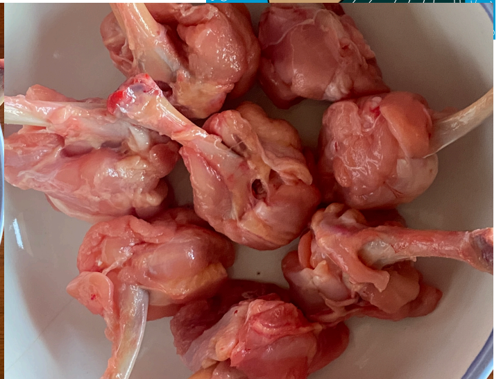
2. Apply salt and lime juice, keep for 10 minutes