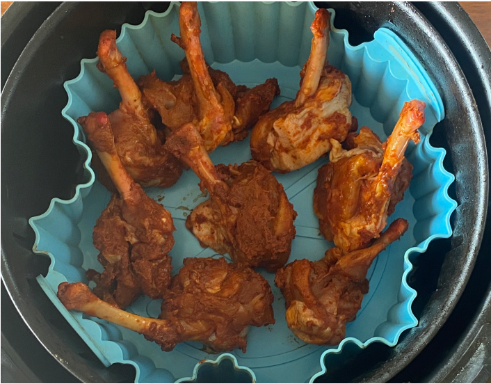
5. Arrange them in the air fryer tray