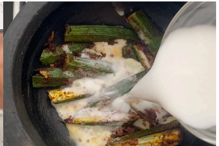
19. Add a quarter of the coconut milk.