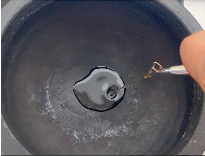
11. heat a cooking pot, add oil.