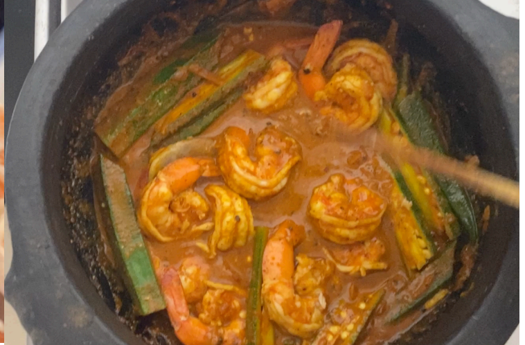
23. Mix thoroughly.