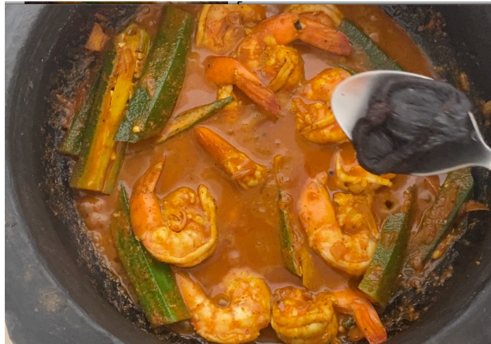
24. Add the Kokum or tamarind.