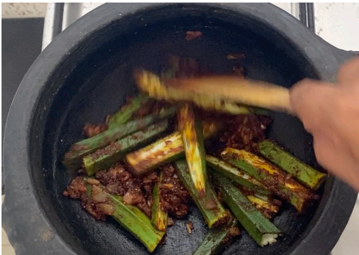
19. Mix thoroughly.