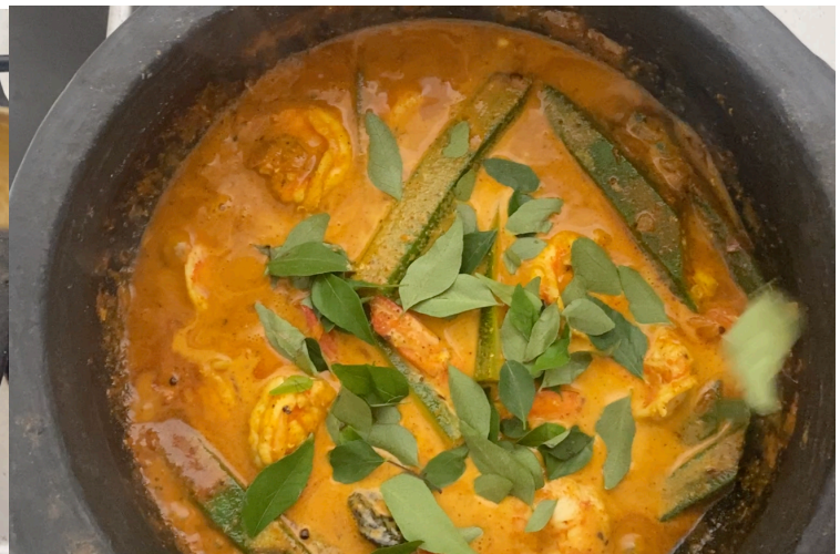
26. Sprinkle the curry leaves.