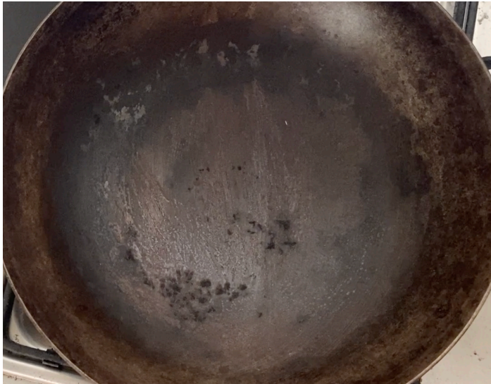
5. Heat a wok.