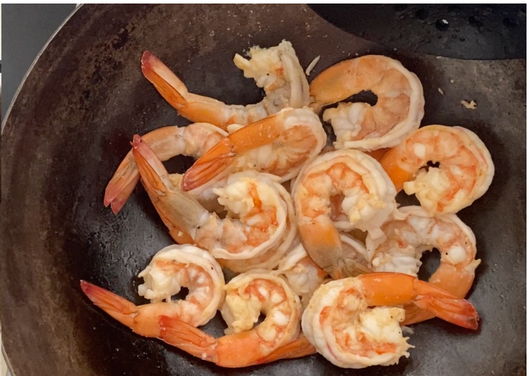
8. Saute until they turn pink.