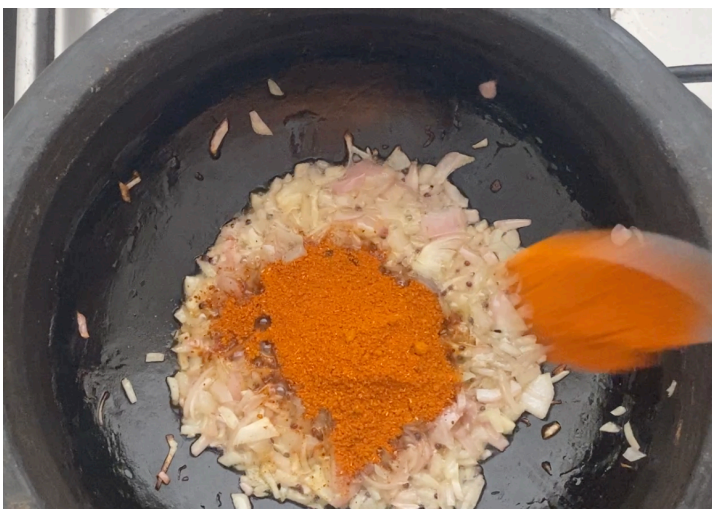
15. Lower the flame and add the Soongta hoomun masala.