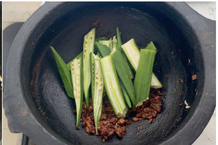
18. Add the okra