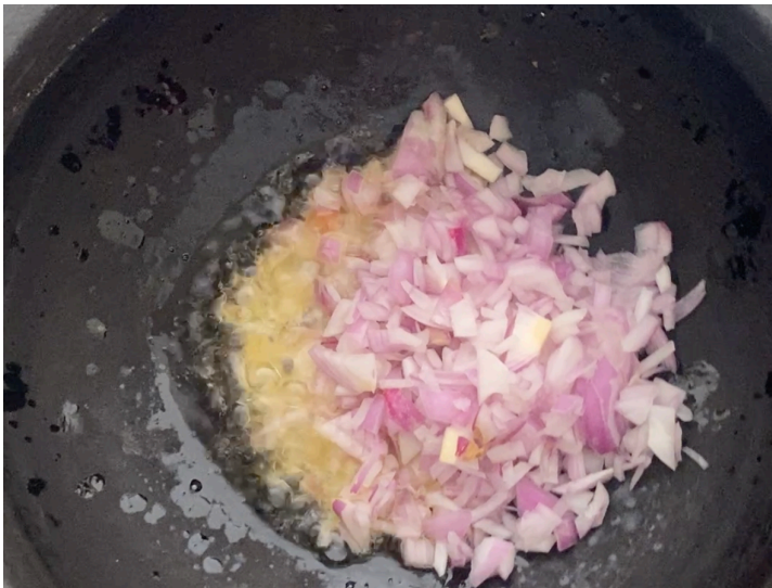
13. Add the chopped onion.