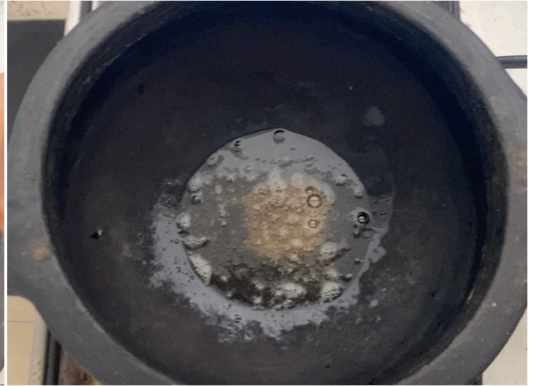
12. Add a tsp of mustard seeds.