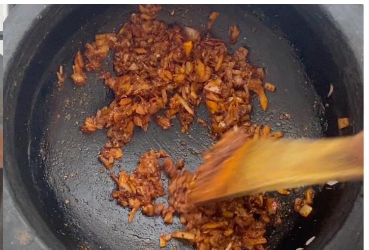
16. Fry the masala while continuously stirring.