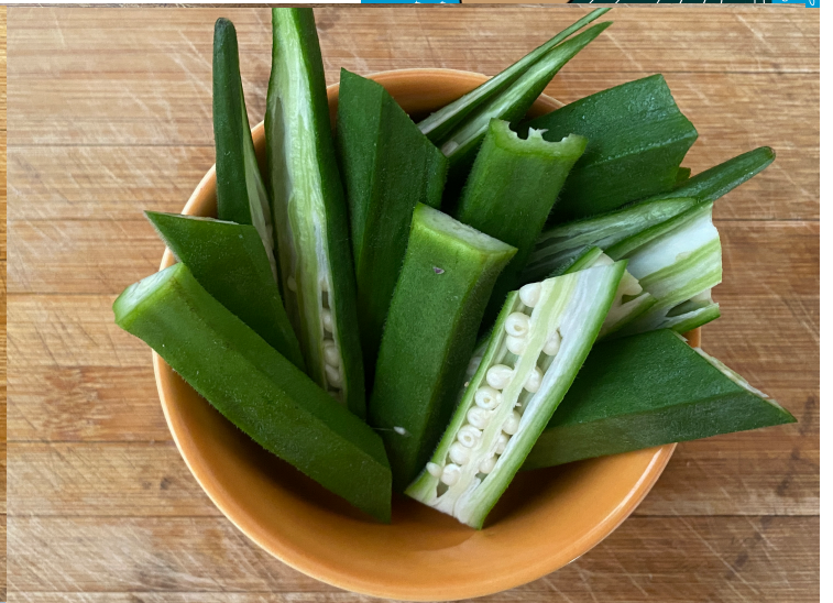
2. Cut the okra and slice in half.