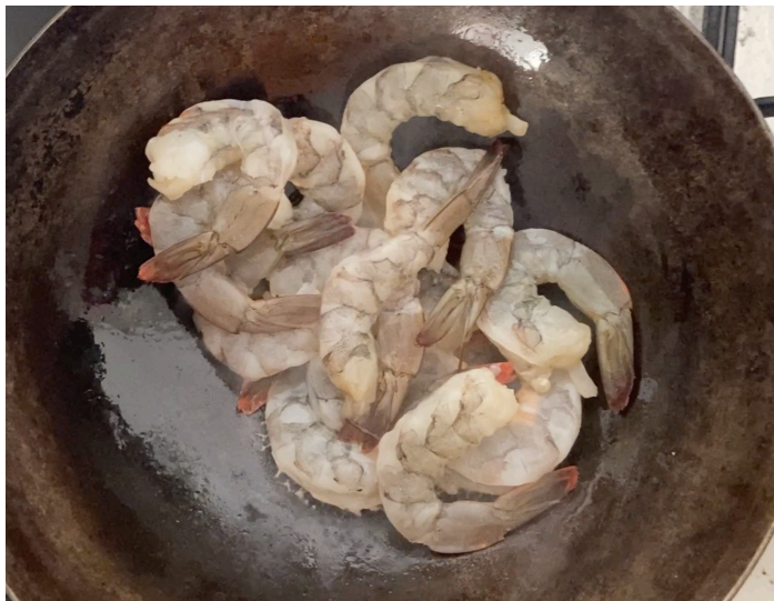
7. Add the prawns.