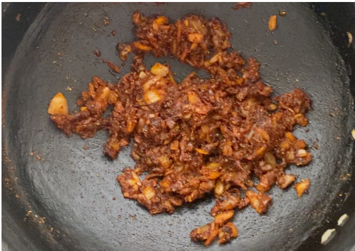
17. The oil will start to separate.