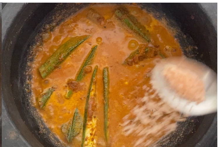
21. Add salt.