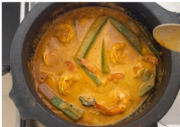
25. Mix Well.