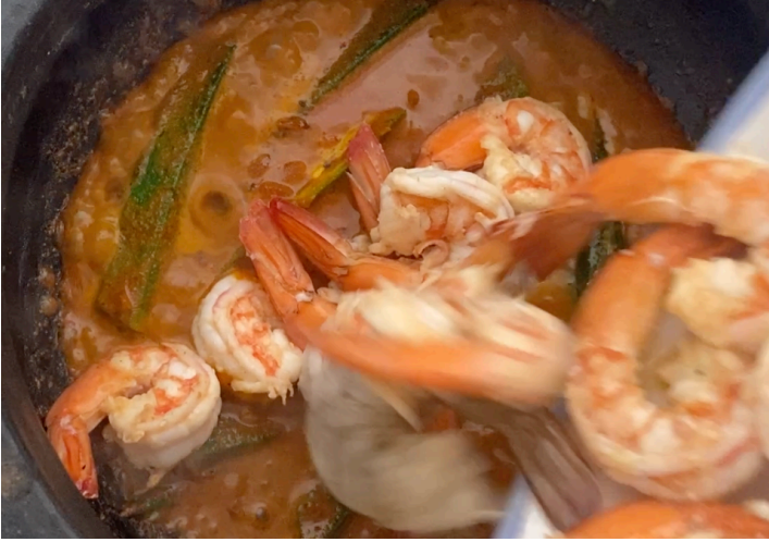
22. Add the prawns