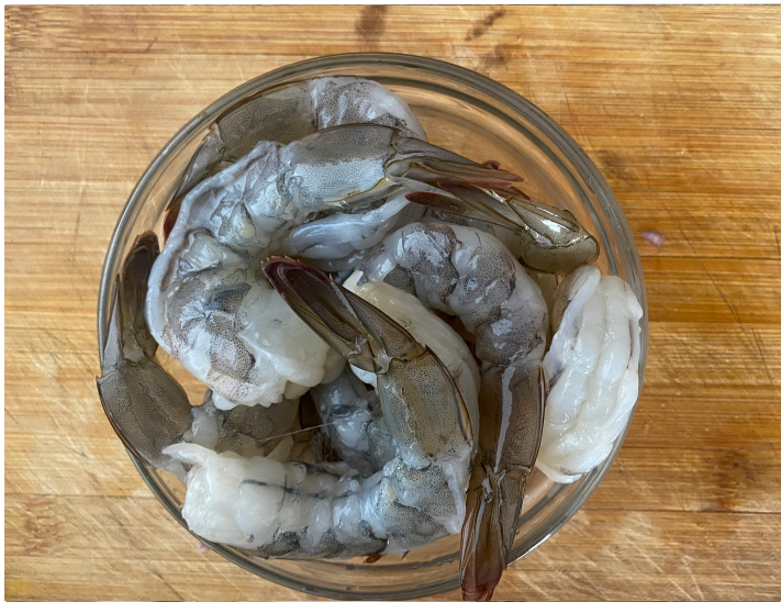
1. Marinate with salt and lime juice. Keep for 10m.