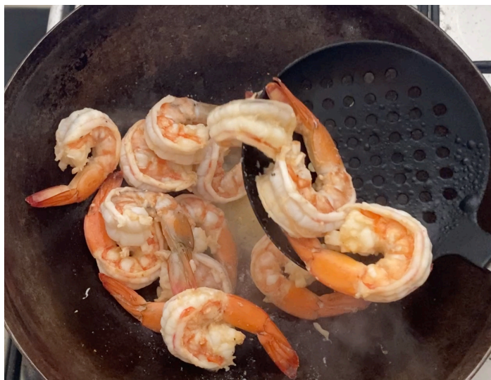
9. Remove them from the wok.