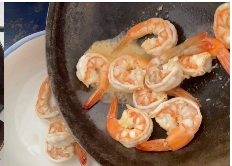
10. Let it rest.