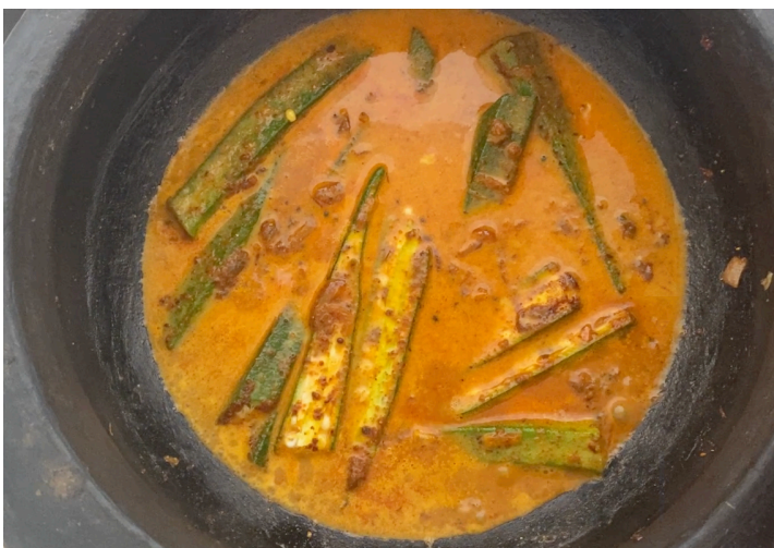
20. Mix well and cook for 5 minutes.