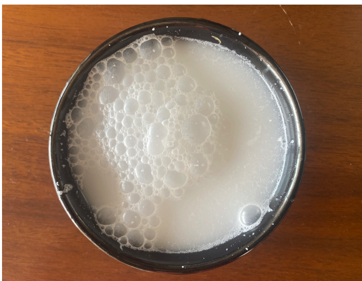
3. Dilute 3/4th of the coconut milk.