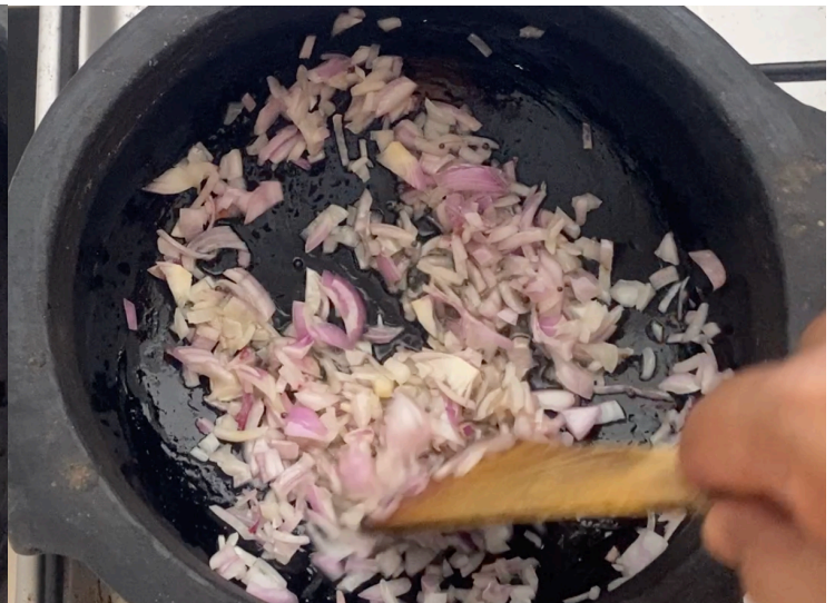
14. Saute until it turns translucent.