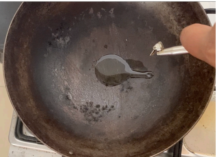
6. Add 2 -3 tbsps of oil.