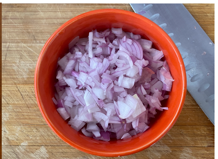
4. Finely chop the onion.