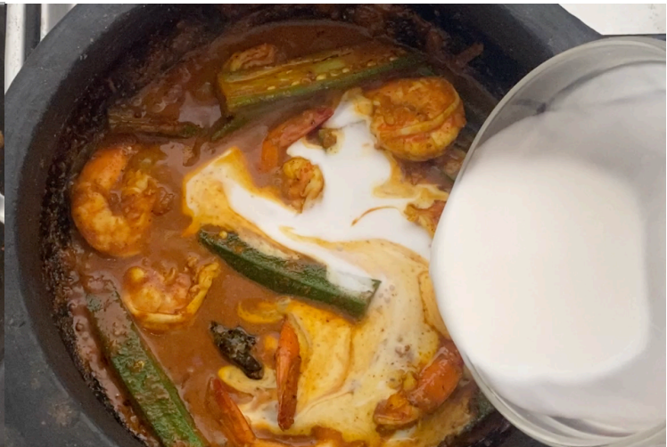
25. Add the remaining thick coconut milk.