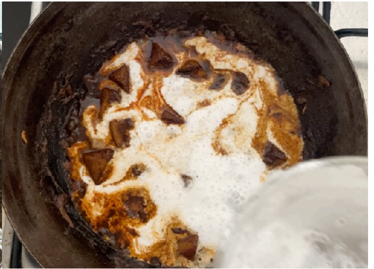
13. Add the fresh coconut milk.