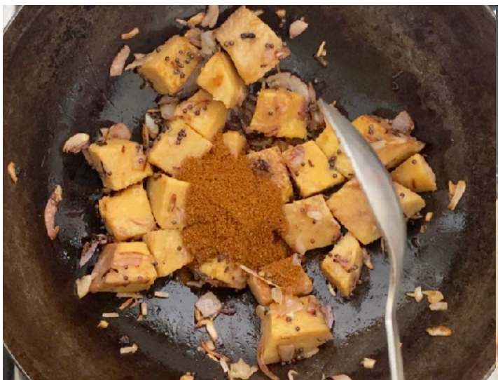
9. Add 2-3 tsps of the Gavli Vegetable masala. Mix well.