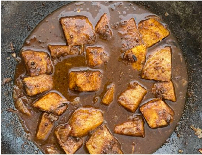
10. Add half a cup of water.