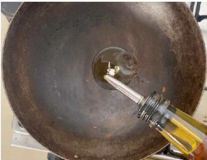
3. Heat 2 tbsps of oil in a wok.