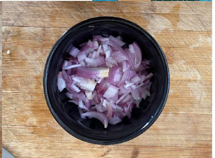
2. Finely chop the onions.