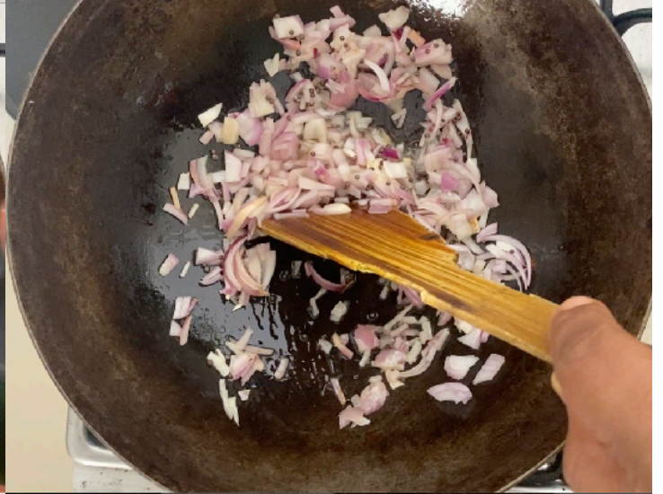
6. Saute well.