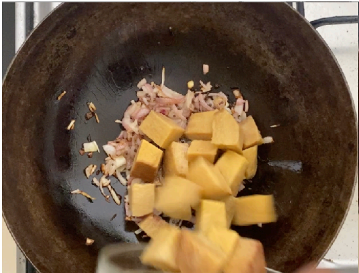
7. Add the yam.