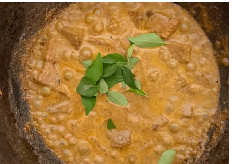
15. Add the fresh curry leaves.