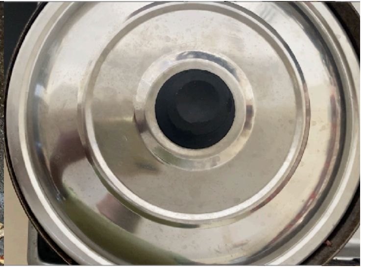
11. Cover and cook for 5-10 minutes.