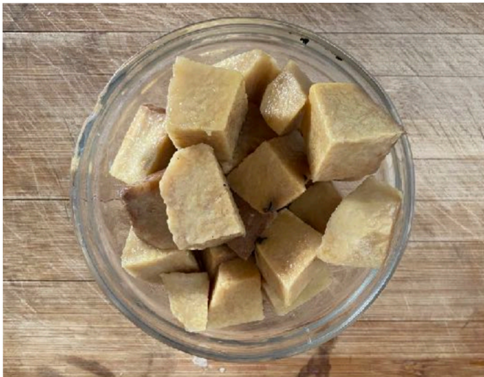
1. Clean and cut the yam to bite sized pieces.