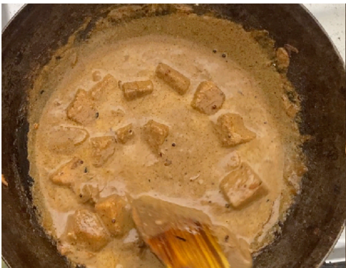
14. Mix thoroughly.