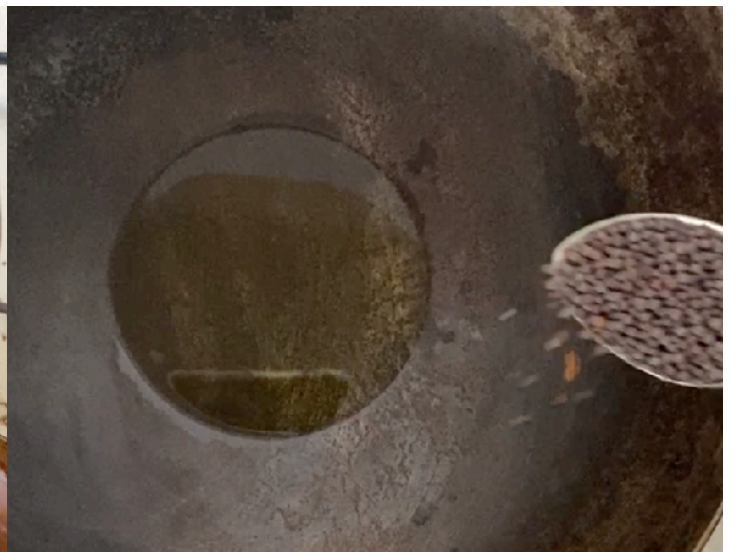
4. Add a tsp of mustard seeds.