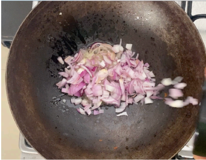
5. When the mustard seeds sputter, add onion.