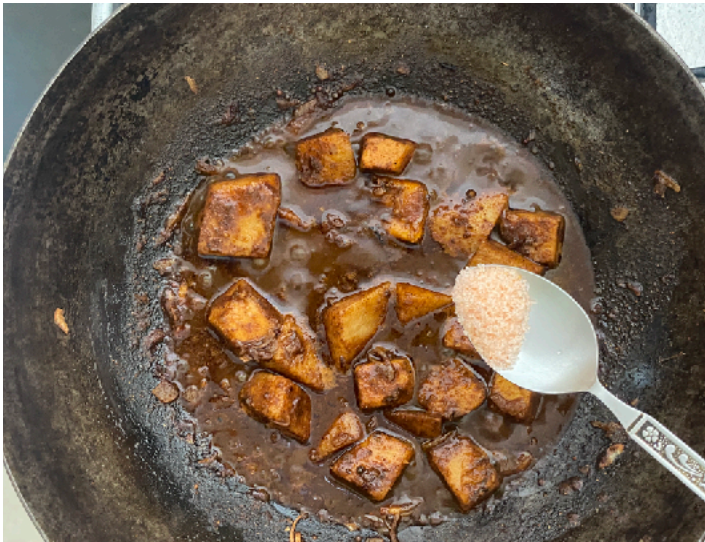
12. Adjust salt.