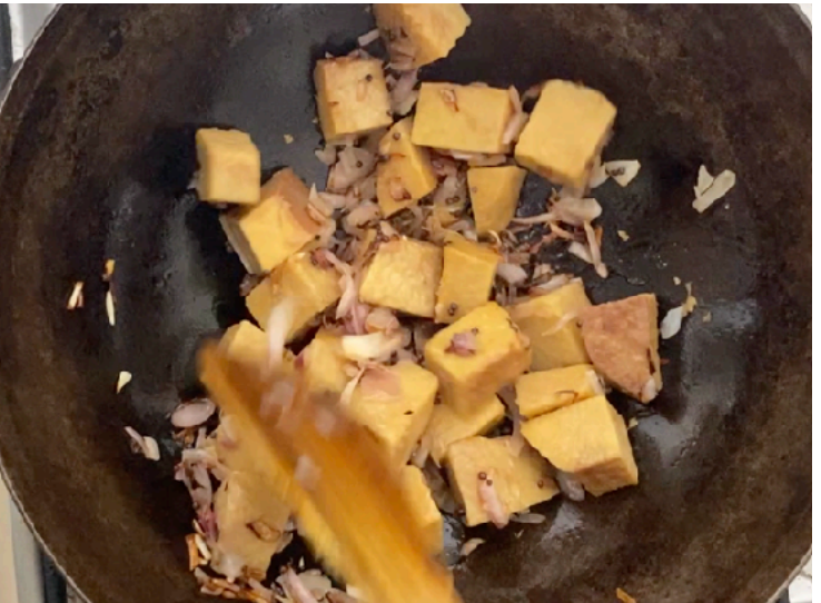
8. Mix well, and fry for 2-3 minutes.